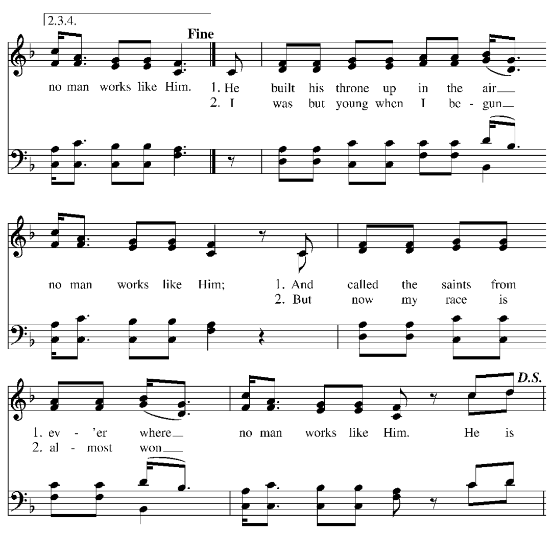
Words: Traditional. Music: Negro Spiritual; arr. Horace Clarence Boyer (b. 1935). Arr. Copyright © 1992 Horace Clarence Boyer.