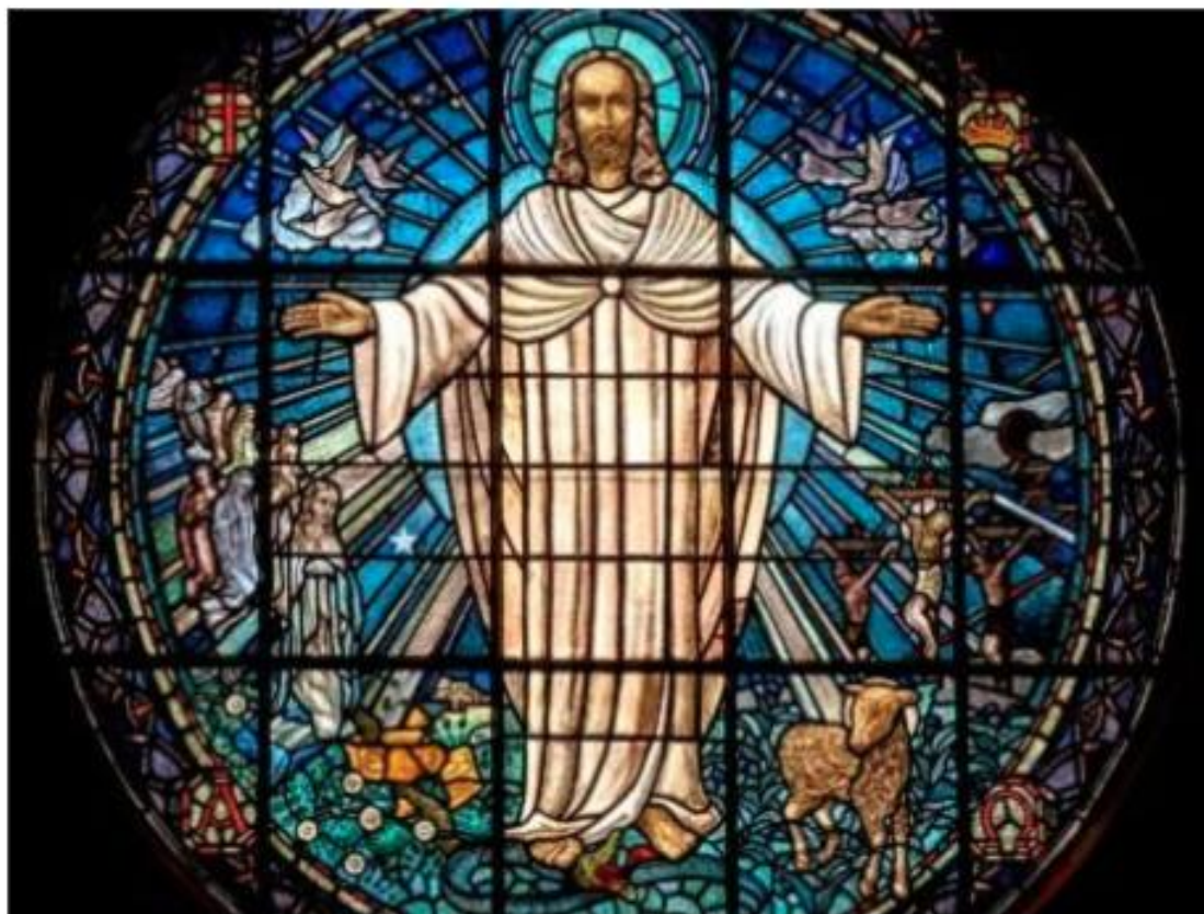
Jesus Gives the Holy Spirit Stained Glass